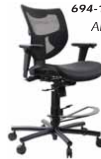
694-16-2-37-21 All Mesh

6 prong heavy duty base standard with no upcharge