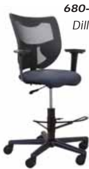
680-16-2-34-21 Dillon Thunder