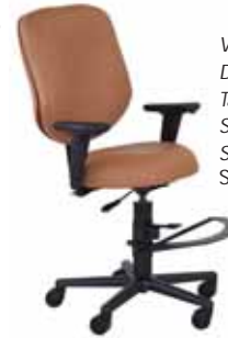
675-16-2-34-21 Dillon Luggage

Wide - 30" Deep - 24" Tall - 47" - 58" Seat Width: - 21" Seat Depth: - 21" Seat Height - 24" - 35"