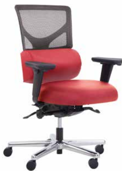
3099-16-8-23 User size 4'8" - 5'3" Maximum weight: 350lbs Seat Height from floor: 14" - 18" Seat Depth: 16" - 18.5" Seat Width: 23" Shown in Dillon Lipstick