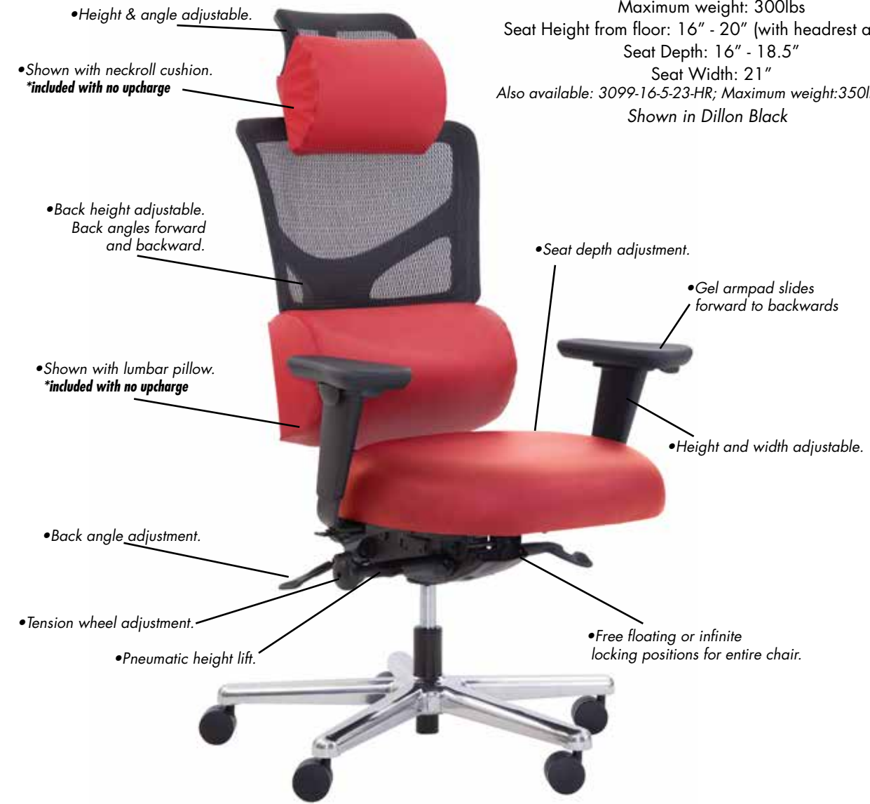
3097-16-8-21-HR User size 5'4" - 5'10" Maximum weight: 300lbs Seat Height from floor: 16" - 20" (with headrest add 6") Seat Depth: 16" - 18.5" Seat Width: 21" Also available: 3099-16-5-23-HR; Maximum weight: 350lbs Shown in Dillon Black