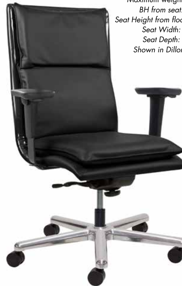
441-16-8-23 Knee tilt w/multiposition tilt lock Maximum weight: 300lbs BH from seat: 23" Seat Height from floor: 18" - 22" Seat Width: 23" Seat Depth: 19" Shown in Dillon Black