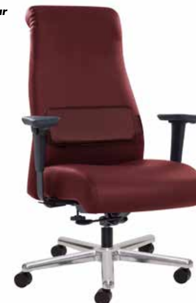
698-16-8-21 BH from seat 26.75" Seat Height from floor: 16" - 20" Adjustable Seat Depth: 17" - 19.5" Seat Width: 21" (will accommodate a 6'1" person) Shown in Dillon Cordovan