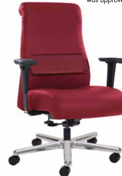
797-16-8-23 - Low Back BH from seat: 24" Seat Height from floor: 16" - 20" Seat Depth: 17.5" Seat Width: 23" (will accommodate a 4'10" to 5'4" person) Shown in Dillon Lipstick