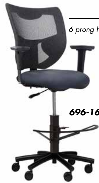
500lb Chair 6 prong heavy duty base standard with no upcharge W - 30" D - 24" H - 47" - 58" SW - 23" SD - 19" SH - 24" - 35" Shown in Dillon Thunder