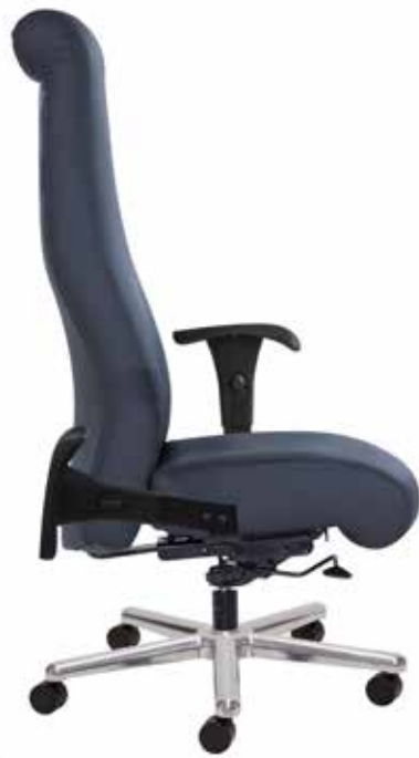
799-17-8-23 High Back BH from seat: 29.5" Seat Height from floor: 16" - 20" Available with 19", 22" and 24" Seat Depth Seat Width: 23" (will accommodate a 6'6" person) Shown in Dillon Thunder