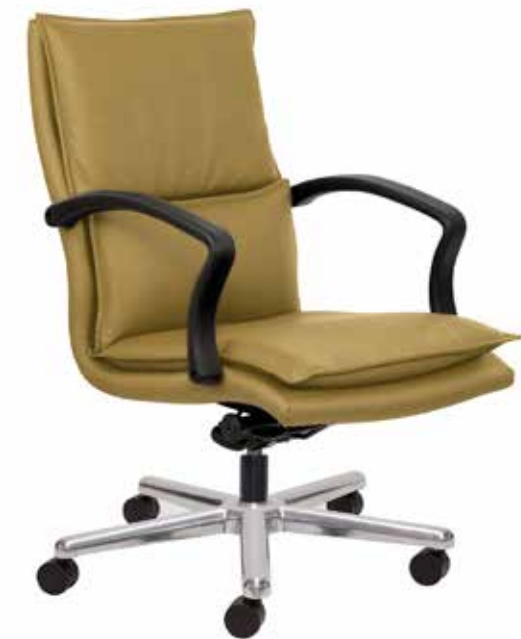
430-54-8-21 Knee tilt w/multiposition tilt lock Maximum weight: 300lbs BH from seat: 22" Seat Height from floor: 18" - 22" Seat Width: 21" Seat Depth: 17.5" Shown in Dillon Straw