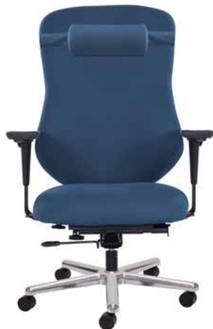
1715-16-8-21 Medium Back Posture knee tilt w/tilt lock Maximum weight: 300lbs BH from seat: 27" (with headrest 36") Seat Height from floor: 17.5" - 21.5" Back & Seat Width: 21" Seat Depth: 19" Shown in Dillon Williamsburg

Shown with optional plastic bumper guard on back