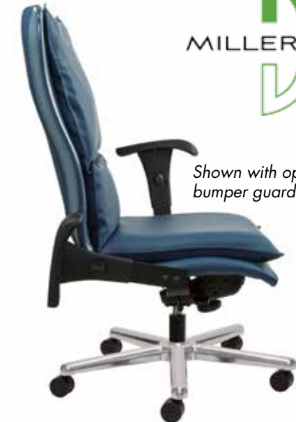
440-17-8-23 Swing Arm Knee tilt w/multiposition tilt lock Maximum weight: 300lbs BH from seat: 22" Seat Height from floor: 18" - 22" Seat Width: 23" Seat Depth: 17.5" Shown in Dillon Ocean

Shown with optional plastic bumper guard on back