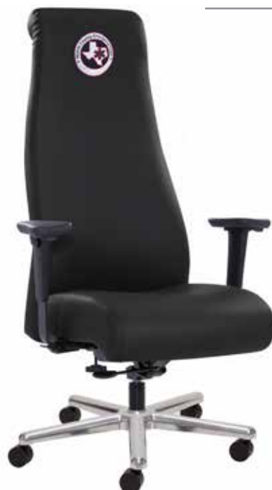
700-16-8-21 BH from seat 34.5" Seat Height from floor: 16" - 20" Adjustable Seat Depth: 19" - 22" Seat Width: 21" (will accommodate a 6'10" person) Shown in Dillon Black