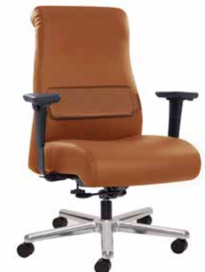
697-16-8-21 BH from seat 24" Seat Height from floor: 14" - 18" Adjustable Seat Depth: 17" - 19.5" Seat Width: 21" (will accommodate a 4'10" - 5'4" person) Shown in Dillon Fiesta