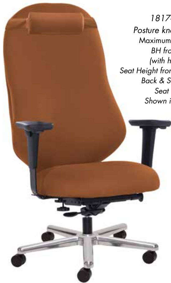
1817-16-8-23HR Posture knee tilt w/tilt lock Maximum weight: 500lbs BH from seat: 27" (with headrest 36") Seat Height from floor: 17.5" - 21.5" Back & Seat Width: 23" Seat Depth: 19" Shown in Dillon Fiesta