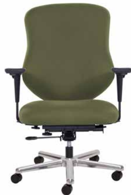
1710-16-8-21 Low Back Posture knee tilt w/tilt lock Maximum weight: 300lbs BH from seat: 22" (with headrest 31") Seat Height from floor: 17.5" - 21.5" Back & Seat Width: 21" Seat Depth: 19" Shown in Dillon Sage