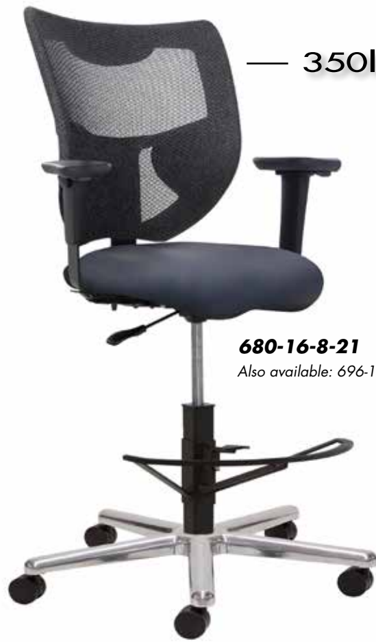
350lb Chair W - 30" D - 24" H - 47" - 58" SW - 21" SD - 19" SH - 24" - 35" Shown in Dillon Thunder