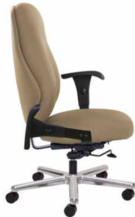
1815-17-8-23 Swing Arm Posture knee tilt w/tilt lock Maximum weight: 500lbs BH from seat: 27" (with headrest 36") Seat Height from floor: 17.5" - 21.5" Back & Seat Width: 23" Seat Depth: 19" Shown in Dillon Buff