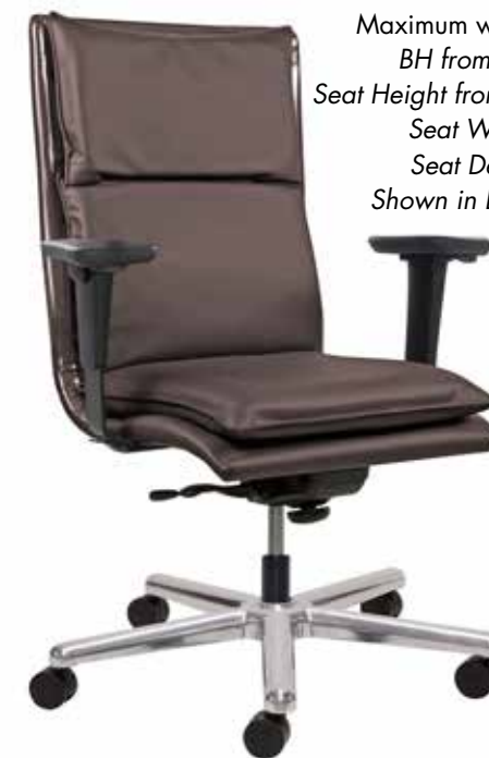
431-16-8-21 Knee tilt w/multiposition tilt lock Maximum weight: 300lbs BH from seat: 23" Seat Height from floor: 18" - 22" Seat Width: 21" Seat Depth: 19" Shown in Dillon Stratus